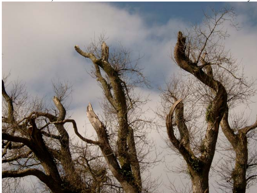
Natural and artificial breakage in an oak tree: both show high levels of growth response (Melbury Park, Dorset)

Branch breakage from mechanical weakness or storm damage results in an array of effects on wood tissue at branch and trunk ends, including fibre separation (along the grain) and splintering in various planes (linear, radial and circumferential). This occurrence creates microhabitats that are colonised by microorganisms and succession species.